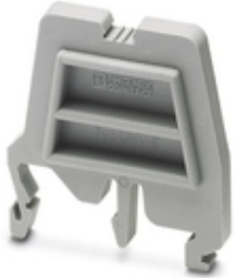
Flange cover, length: 43.3 mm, width: 5.2 mm, color: gray

Please be informed that the data shown in this PDF Document is generated from our Online Catalog. Please find the complete data in the user's documentation. Our General Terms of Use for Downloads are valid ( http://phoenixcontact.com/download )